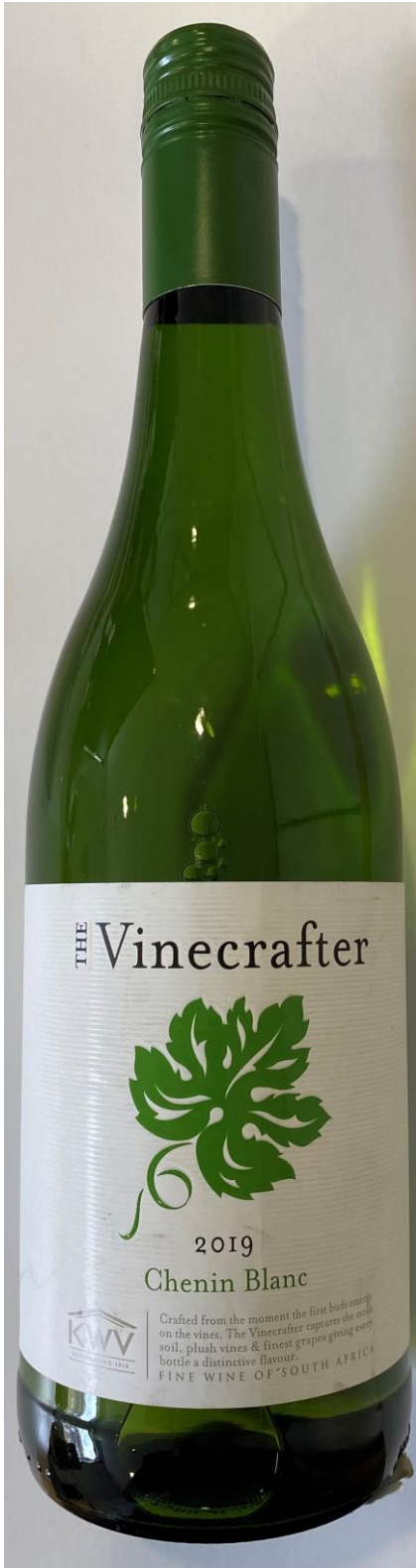
White Wine - Vinecrafter - Chenin Blanc (12.5%) – 75cl