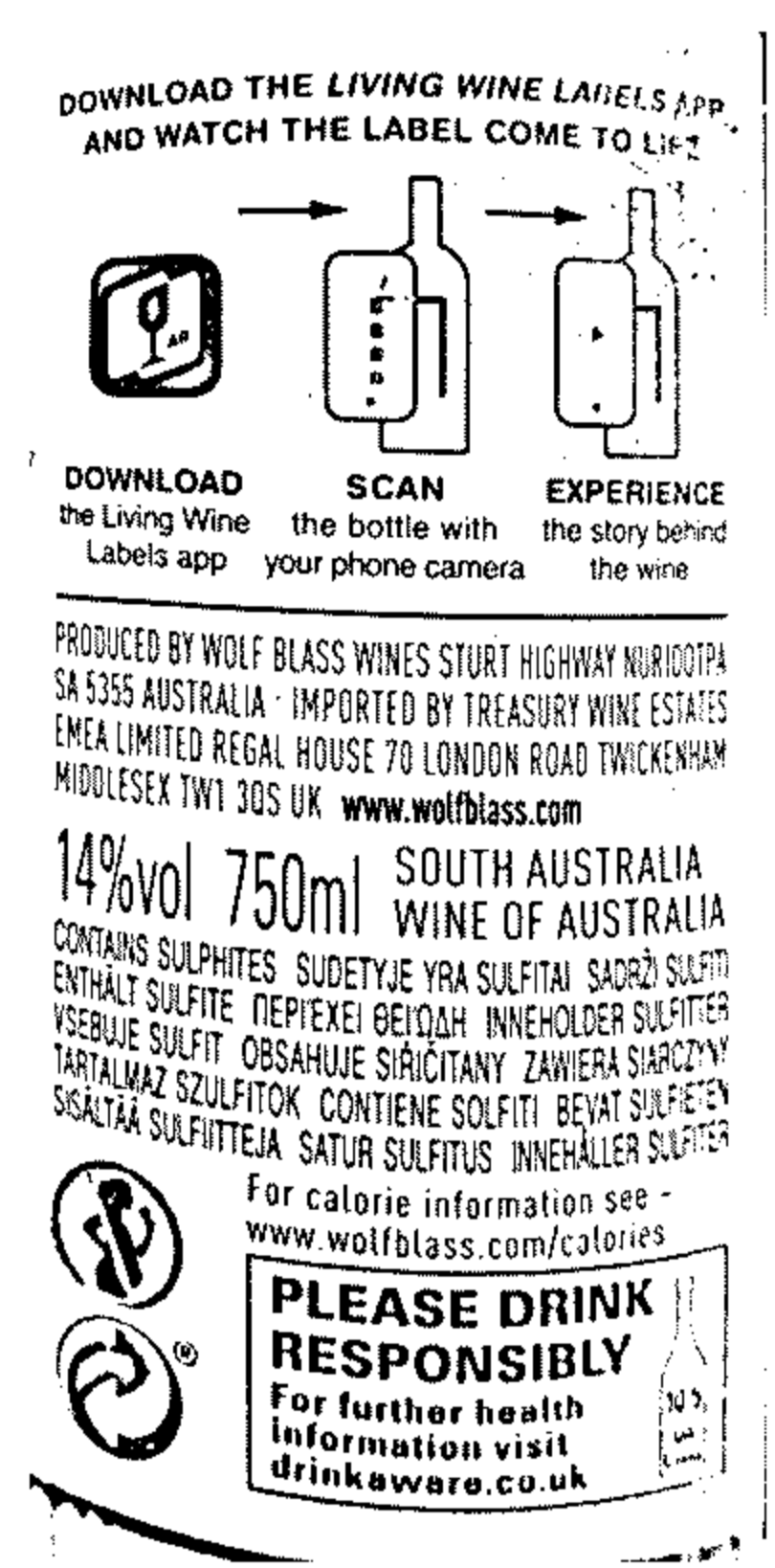
Wolf Blass, Yellow Label, Shiraz, 75cl