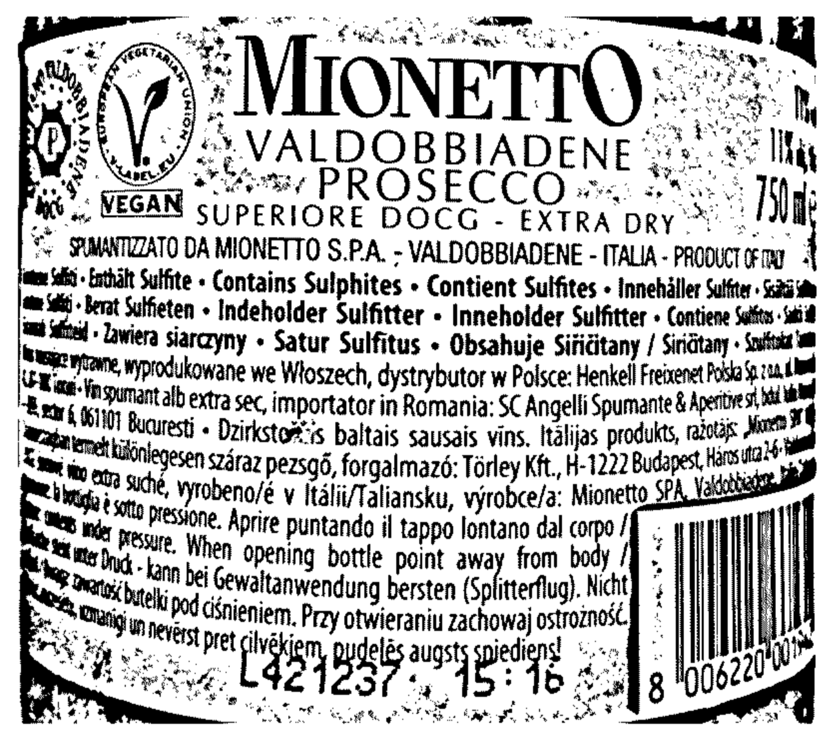
Mionetto, Yellow Label Prosecco, 75cl